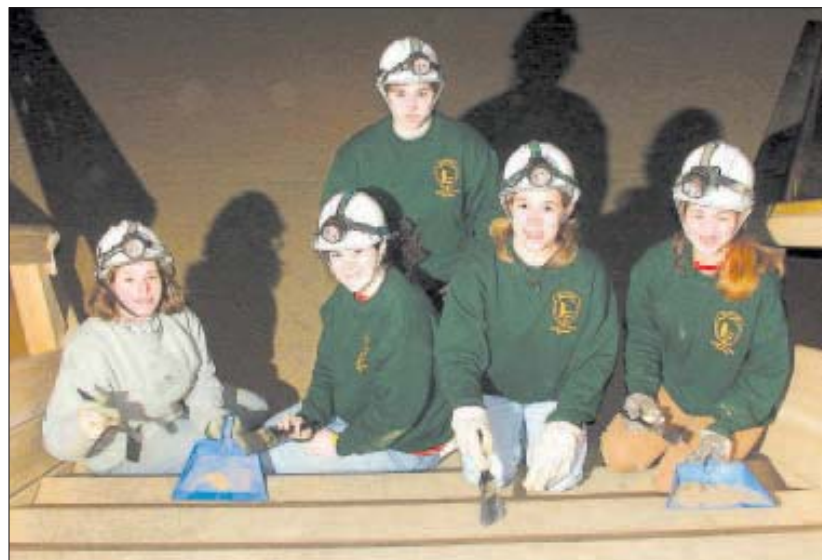
Waynesburg College (Waynesburg, PA) lint crew in the Historic Section of Mammoth Cave.

Some of the most popular caves in the country are within our national parks. Mammoth Cave National Park ( www.nps.gov/macn ), located in central Kentucky, has over 400,000 visitors tour the cave each year. As you can imagine, this many people create quite a pile of lint. Each year, volunteers and staff at Mammoth Cave host "Lint Pickin' Days" in the cave.