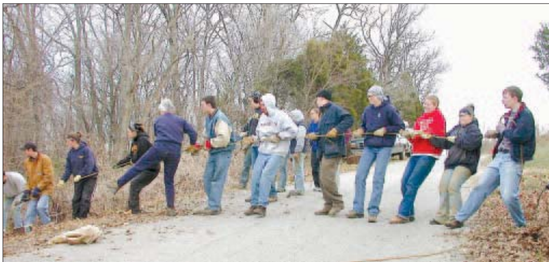
Volunteers from Trinity Christian College (Palos Heights, IL) participate in annual "Don't Mess With Mammoth Days" cleanup event.