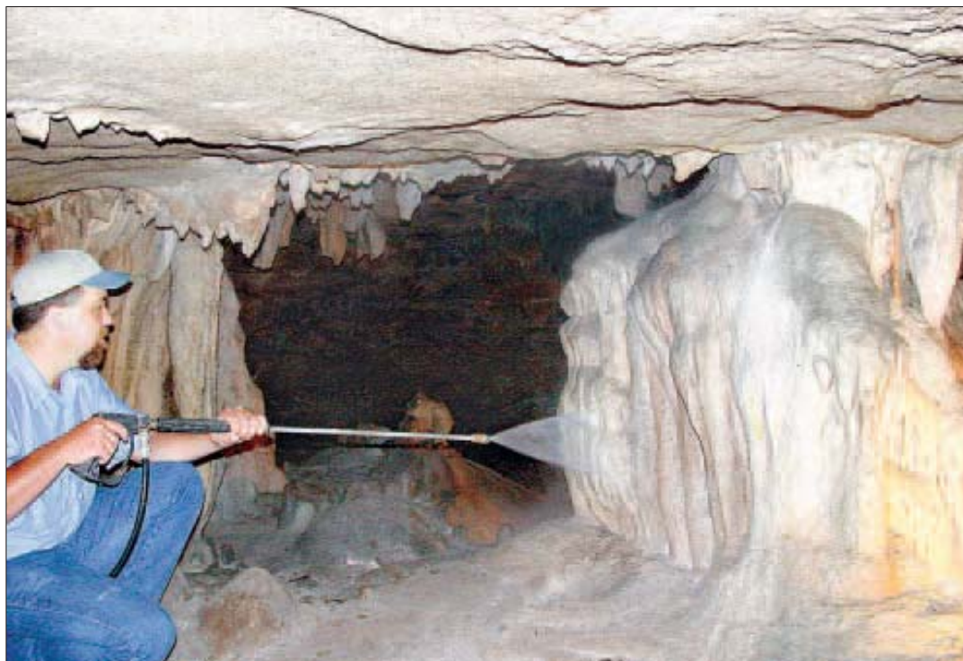
Cave staff at work pressure cleaning dust and lint from formations.